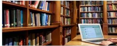
Digital & Physical Library