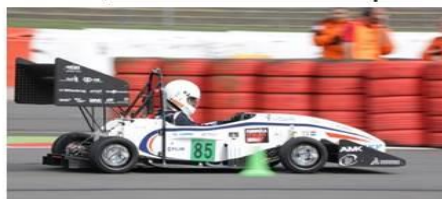
Challenges & Competitions