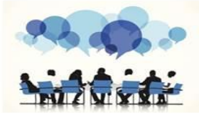
Lectures, Webinars, Conferences, Discussion Forums, and Training