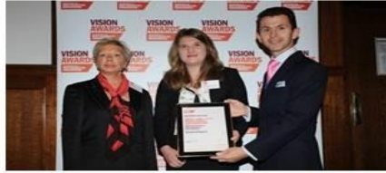
Awards & Grants