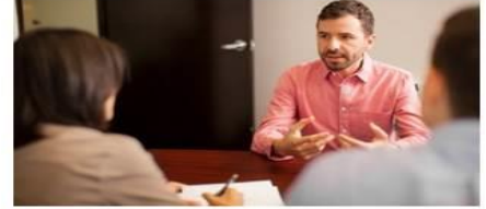
Continuous Professional Development