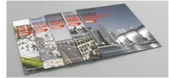
Professional Engineering Magazine